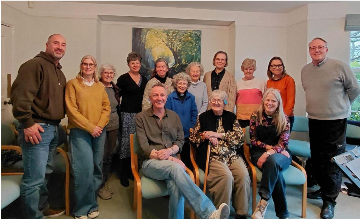
Photo: Oasis Prayer Day - just one example of how our Church community join together.